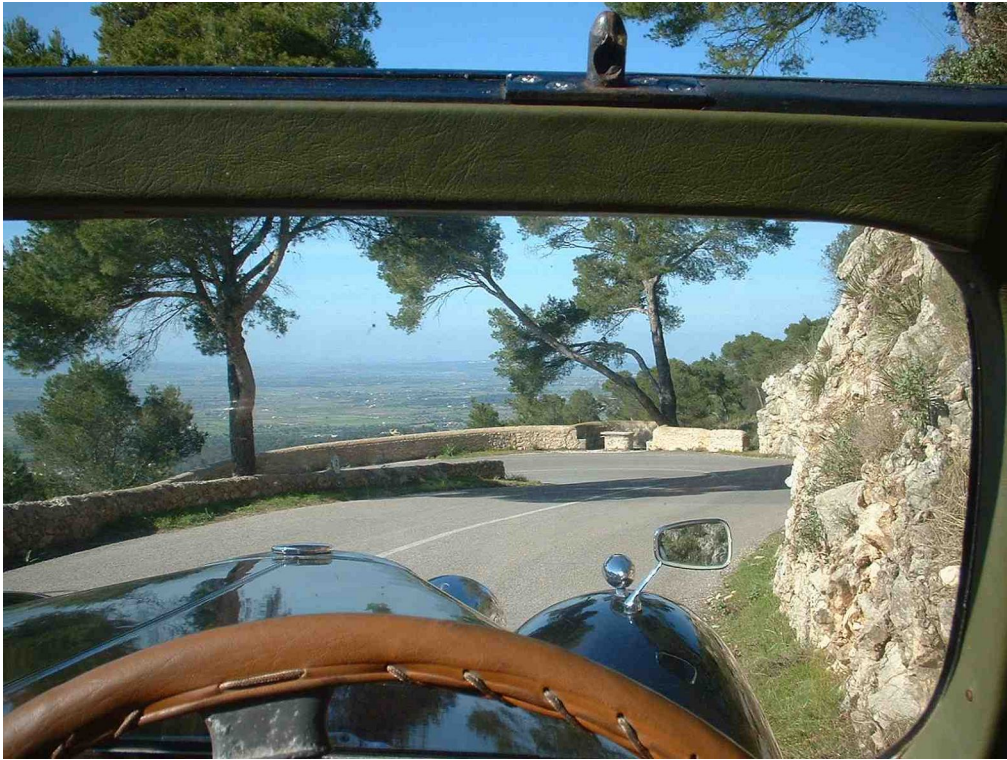
a few tight bends