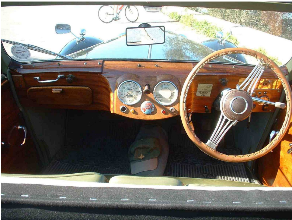
Note temperature guage and oil pressure