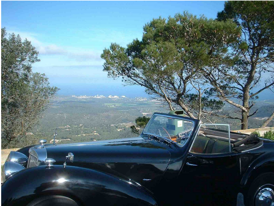
Still on the top with Porto Colom in the background